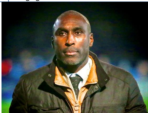
Sol Campbell Macclesfield Town Manager